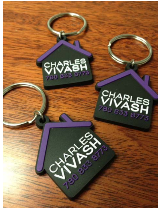
* PVC Key Chain Samples (See Item # 19)

*$20 Flat Rate Shipping to All Major Cities (for All of the Above Key Chain Products)